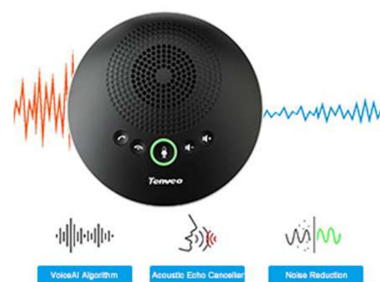
Echo cancellation and noise reduction