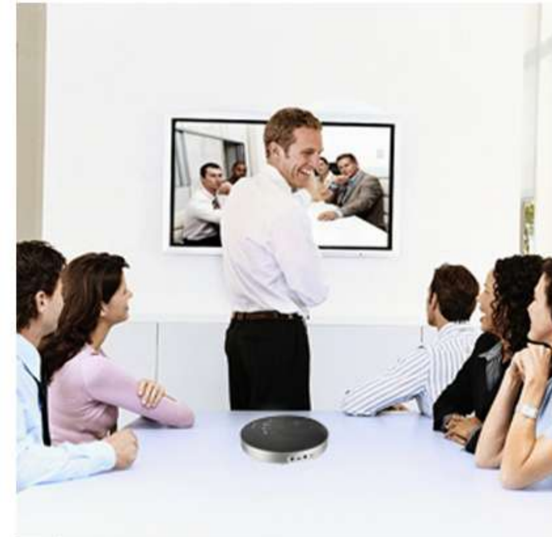
4 m sound-pickup diameter