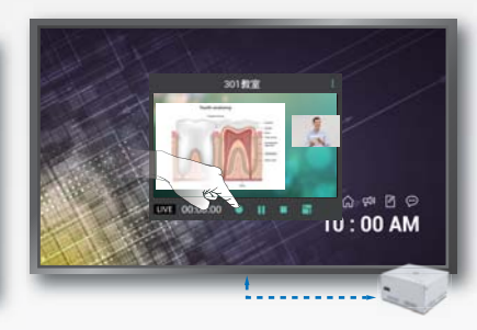
On-screen GUI & USB Interface*