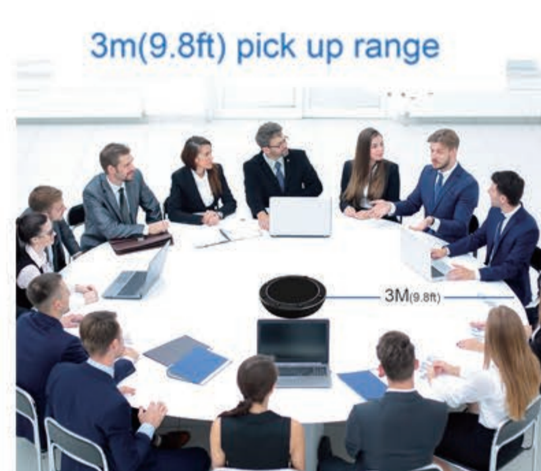
3 m sound-pickup diameter