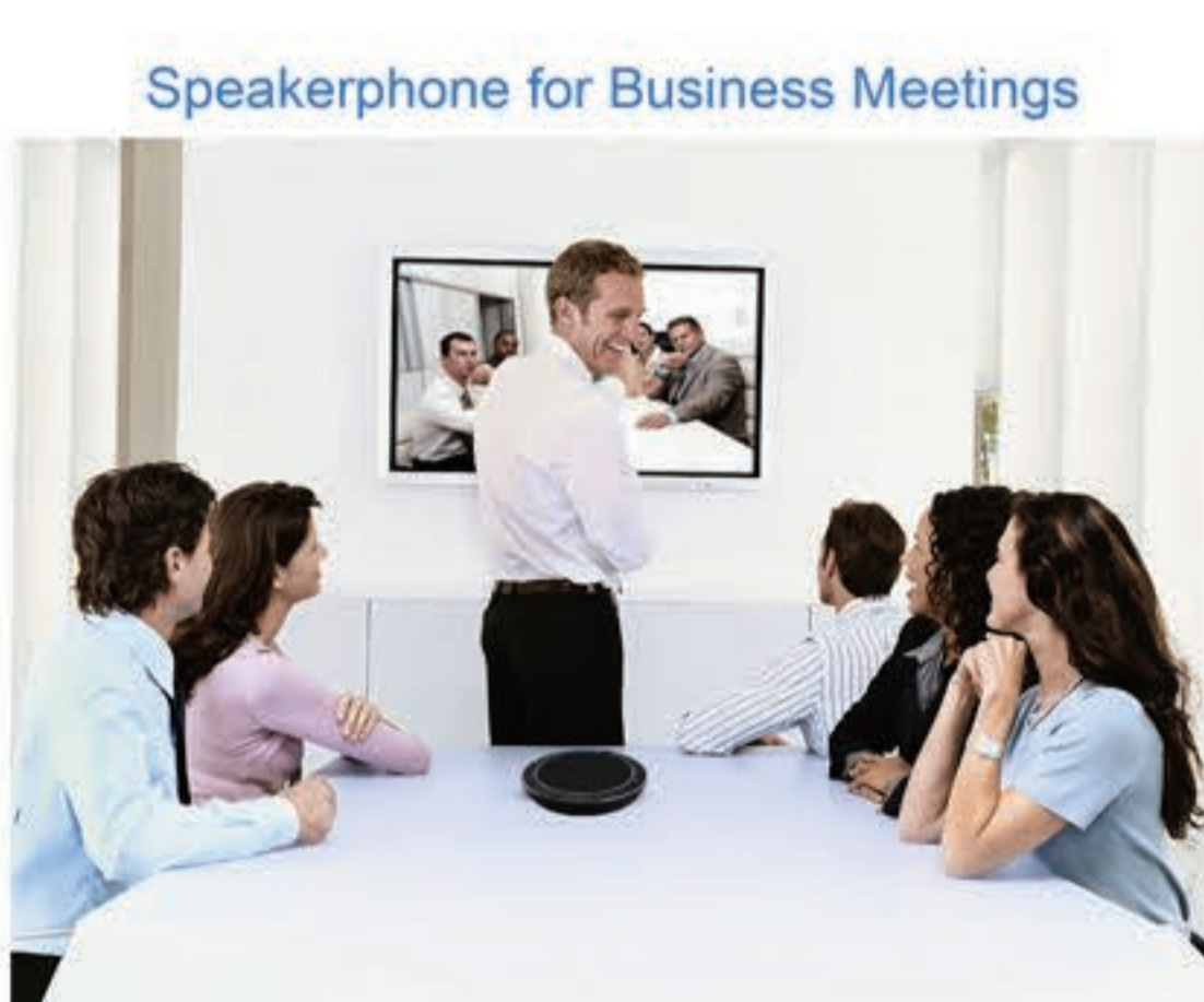
Speakerphone for small meeting