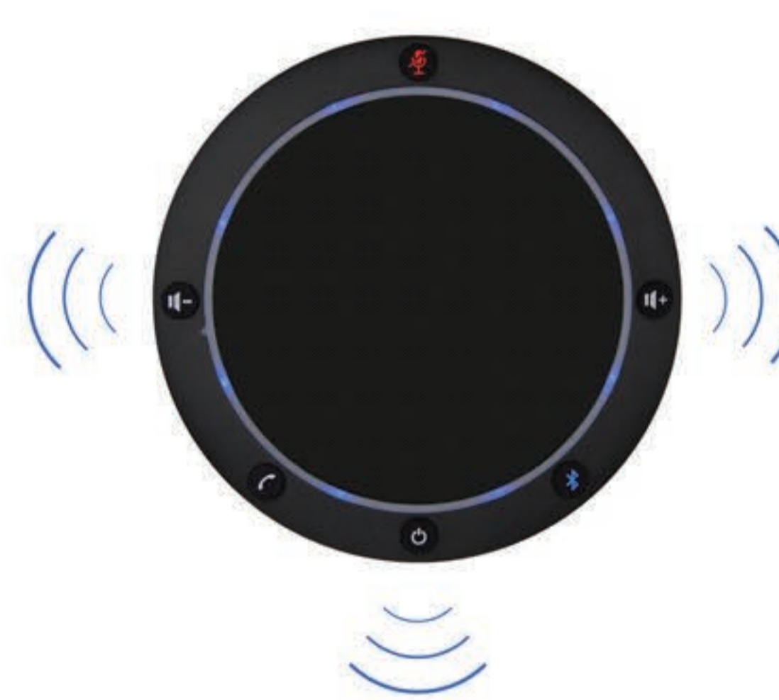
3 built-in Omni-directional microphones