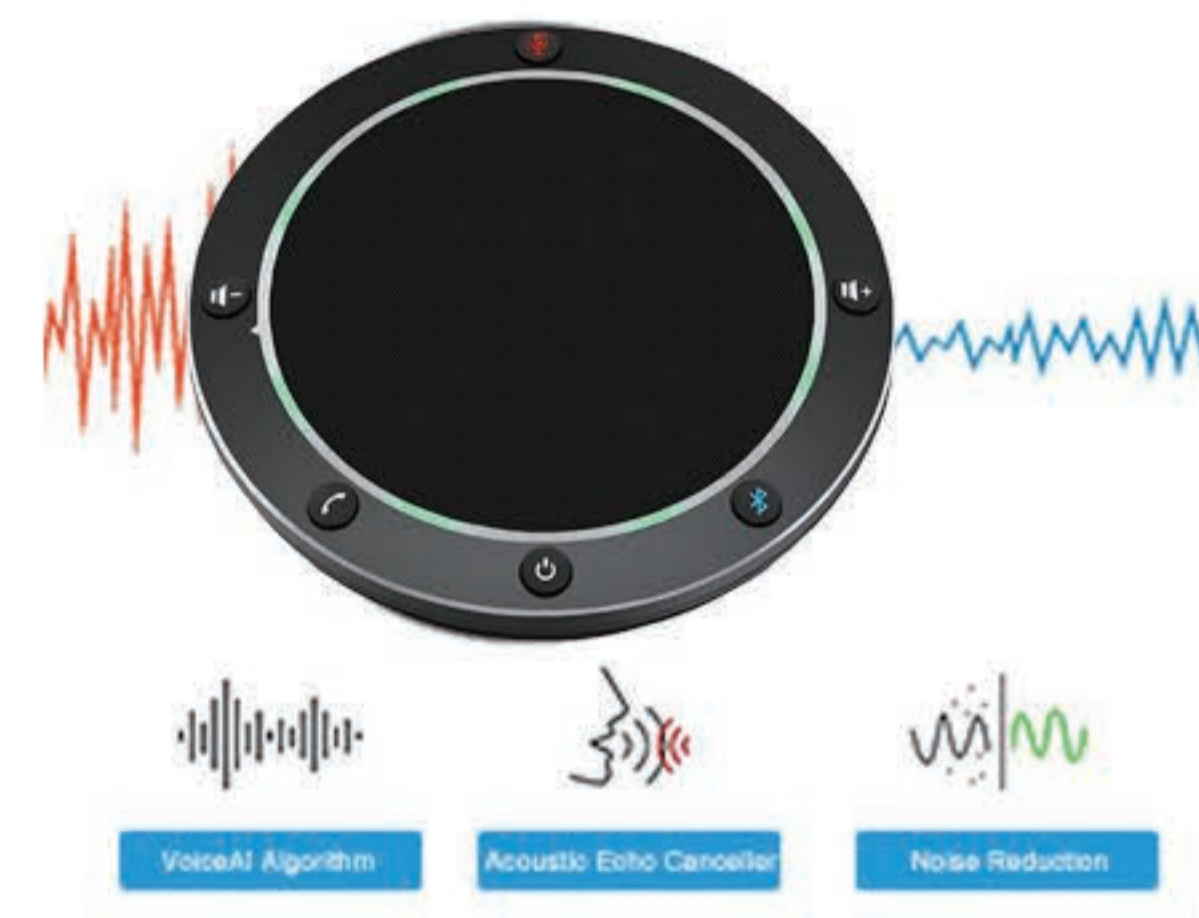
Echo cancellation and noise reduction