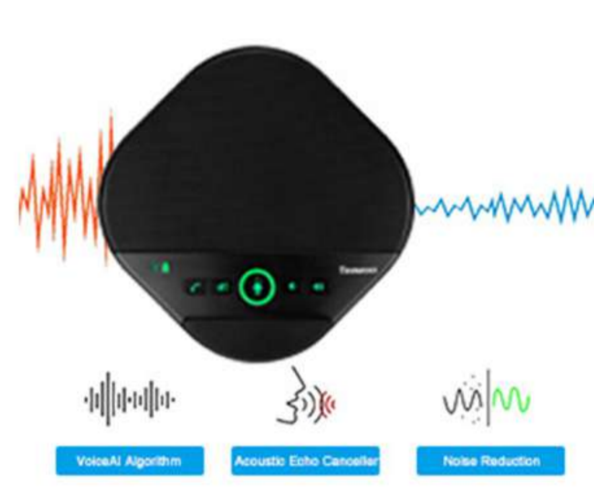
Echo cancellation and noise reduction