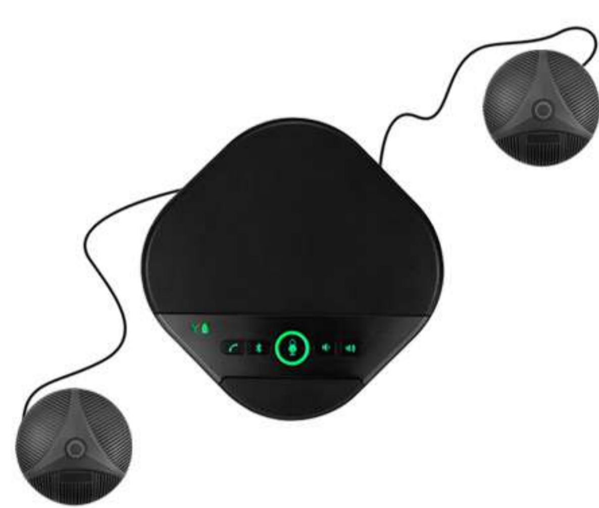
Expansion Mics (need to buy)